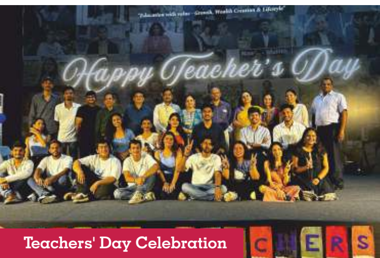
Teachers' Day Celebration