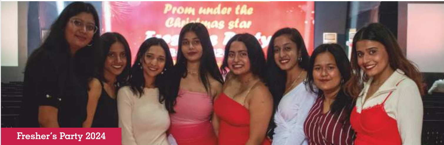
Fresher's Party 2024