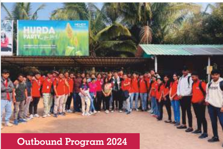
Outbound Program 2024