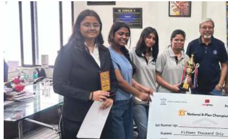
IIM Bangalore National Championship!