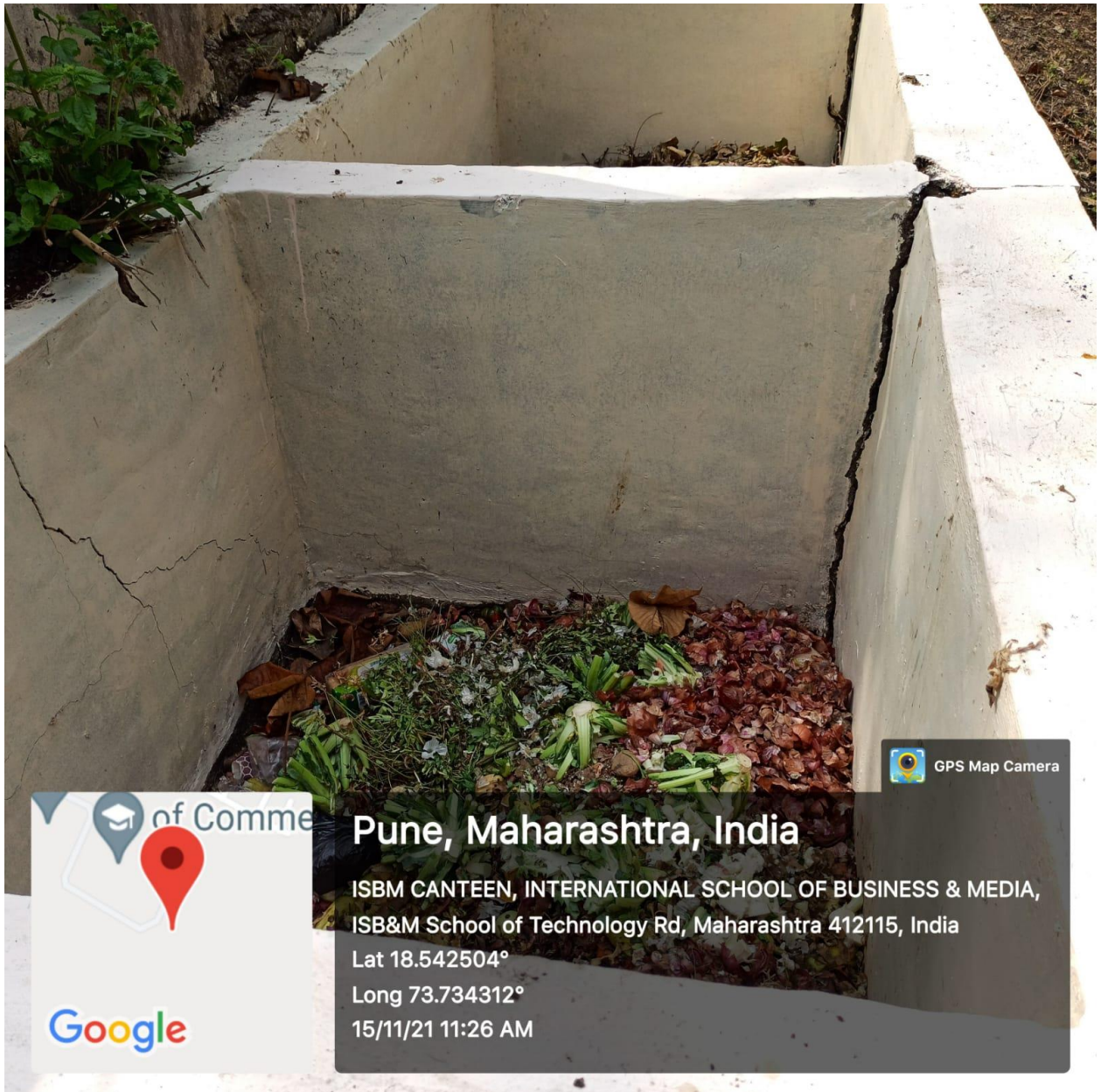
Fig 1(e): Bio-Composting Pit in the Campus