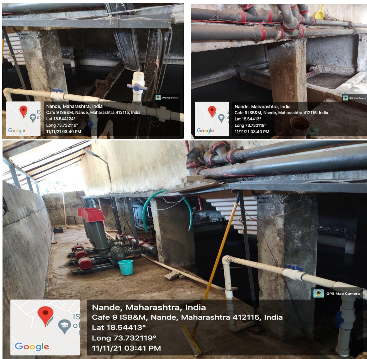
Fig 2(a): Sewage Treatment Plant

Waste water treatment is done through Sewage Treatment Plant, in which, the contaminants are removed from waste water and used for gardening and other purposes. Different kinds of filters are used in STP such as "Activated Carbon Filter" used to absorb chlorine, organics, color, taste and odor from wastewater and those are replaced at regular intervals.