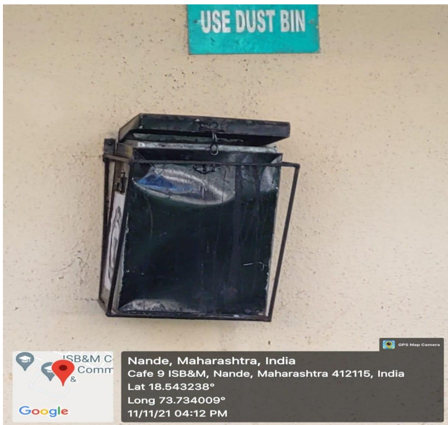
Fig 1(d): Installation of Dustbins in the Campus