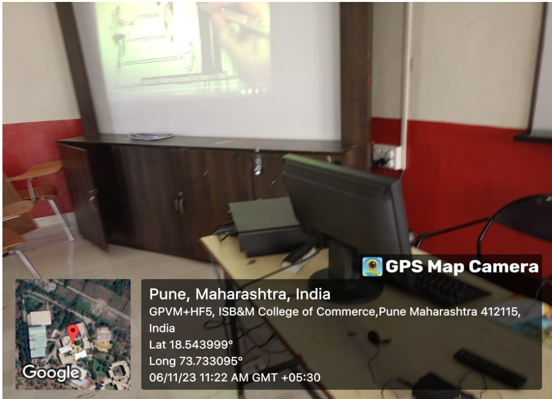
Every Classroom is well equipped with desktop computers and Projector Screens.