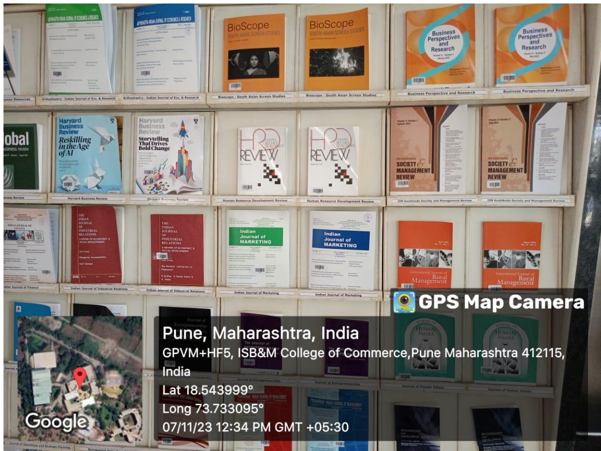
Display of the Journals subscribed by College for the students research and projects.