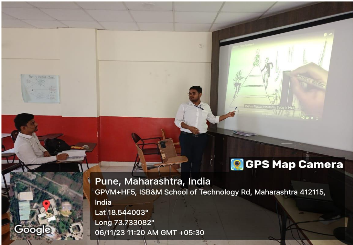
Students making adequate use of youtube and online learning sessions.